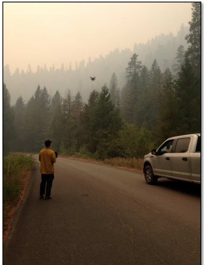
Fireline Operations with 3DR Solo Quadcopter