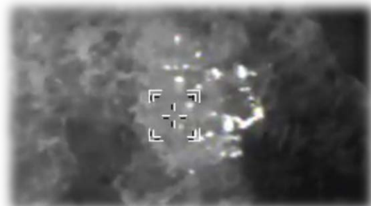
IR image of lightning caused fire in the Aldo Leopold Wilderness

While assigned to the Skid fire, lightning ignited another fire in the wilderness area. The UAS crew was able to fly 10 miles from the ground station, find the fire and relay a size up (location, size, fire behavior, etc.) to fire management personnel. Lessons learned during this activation will be documented and applied to future assignments.