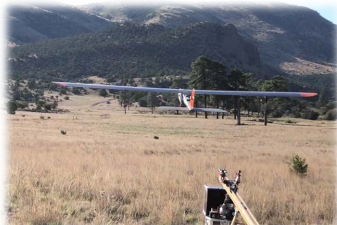
Silent Falcon Takeoff (Gila NF)

Silent Falcon was mobilized on 7/5/19 to the Miller Fire in southern Arizona and reassigned to the Skid Fire in New Mexico on 7/12. This is the first CWN activation of the 2019 fire season. Federal UAS Manager and Data Specialist positions were filled and trainee positions were authorized by the requesting unit. The Miller fire was managed by a Type 2 IMT (Swope). Silent Falcon was utilized for perimeter mapping, infrared detection, and situational awareness. 12 flights were conducted for a total of 9.5 hours of flight time.